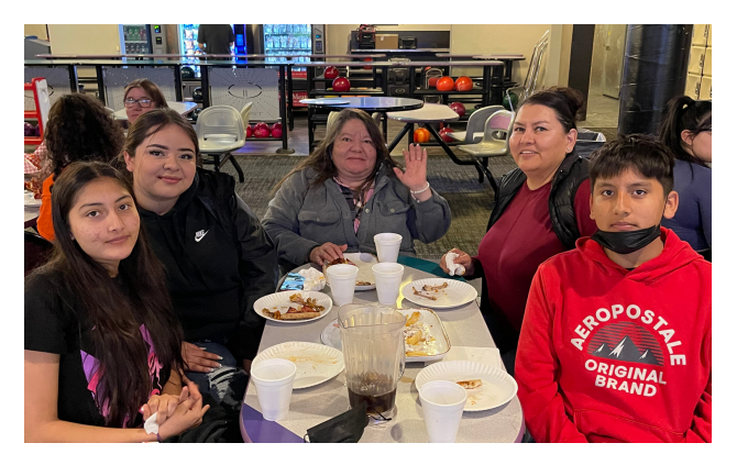
Moses Lake, WA