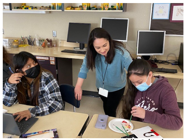
Mt Vernon, La Venture Middle School

ACHIEVE is an after-school Social Emotional Learning (SEL) and Cultural Relevant Youth Empowerment & Leadership program that supports students based on their current circumstances goals and needs. Along with student support, the program provides family support to strengthen student and parental engagement and relationships to enhance overall student life achievement.